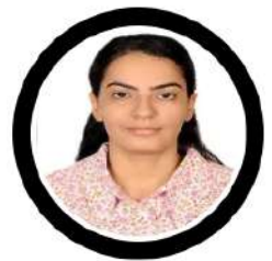
Ruhani AIR 5 - UPSC CSE 2023